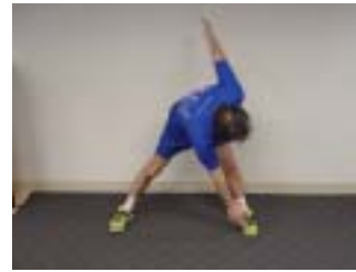
Crossover Toe Touch 10 rep each side