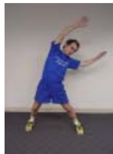
Round the World 10 reps each way