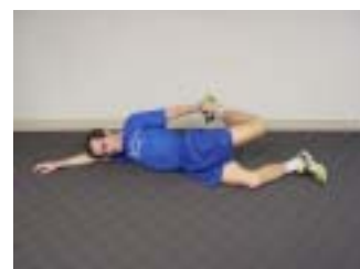
Lying Quad (each leg) Quads