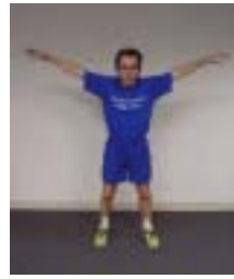
Arm Rotations 15 - 20 each way