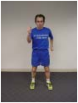
Running Arm Swings slow to faster/20-30x