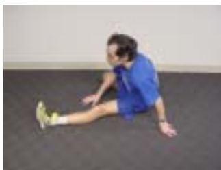
The Hurdler (each leg) Hamstrings