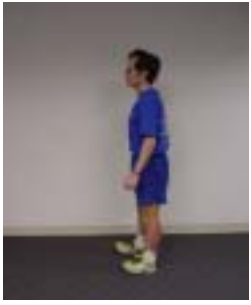
Shin Walks 20-30 yards/3-4x