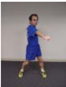
Helicopters 15 - 20 reps