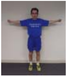
Sun Worshipers 15 - 20 reps