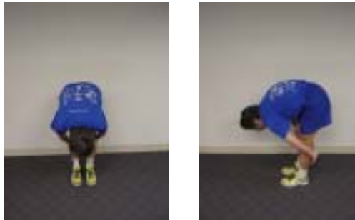
Bend Over Leg Hug Hamstrings