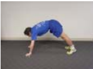
Inch Worms 20-30 yards/3-4x