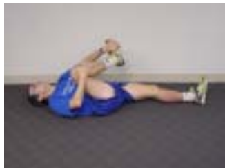
Knee to Shoulder (each leg) Buttocks